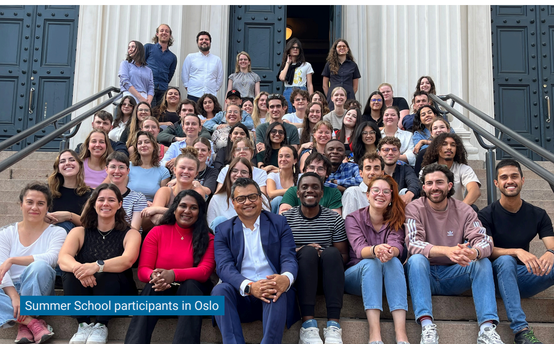
Summer School participants in Oslo

Organised by the Knowledge Hub Global Health and led by Université Paris Cité, the Summer School “Rethinking Global Health” offered a unique environment of exchange between academics and students on a variety of topics reflecting the diversity of the challenges and opportunities of Global Health.