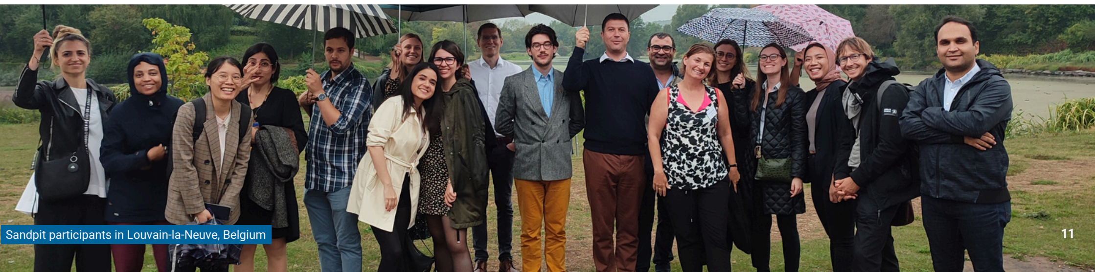
Sandpit participants in Louvain-la-Neuve, Belgium

The November Sandpit round aimed to develop and support the most promising ideas that had emerged to turn them into concrete project proposals to be submitted to external funding bodies.