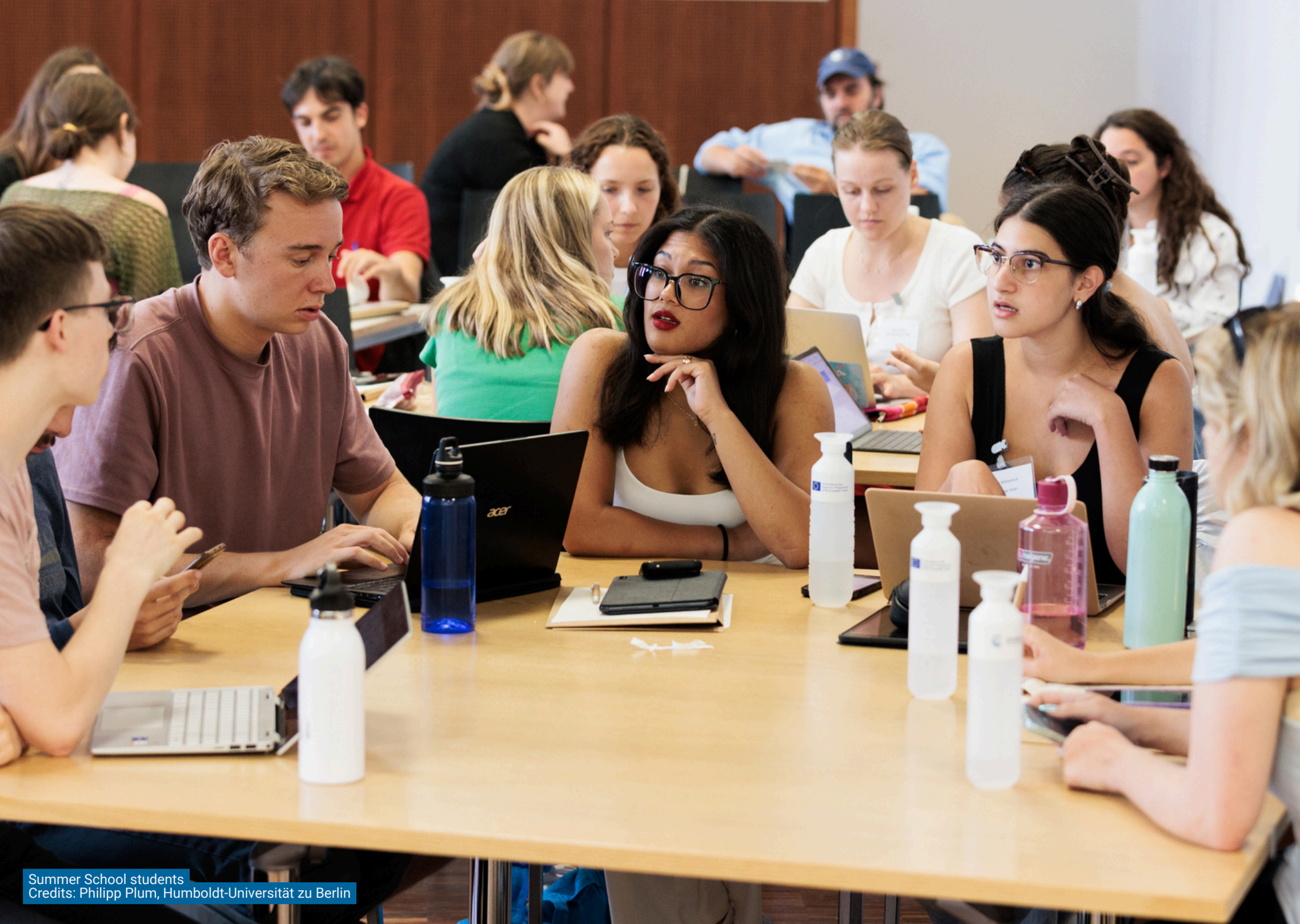
Summer School students