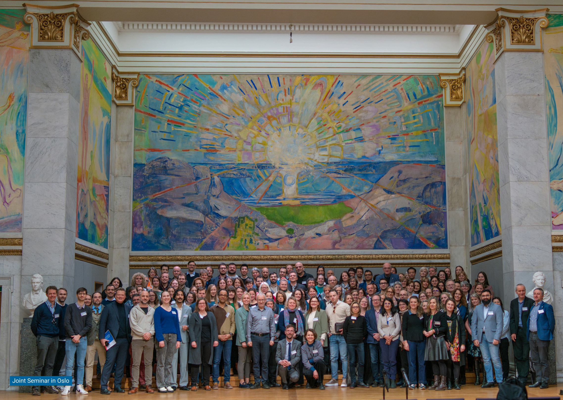
Joint Seminar in Oslo