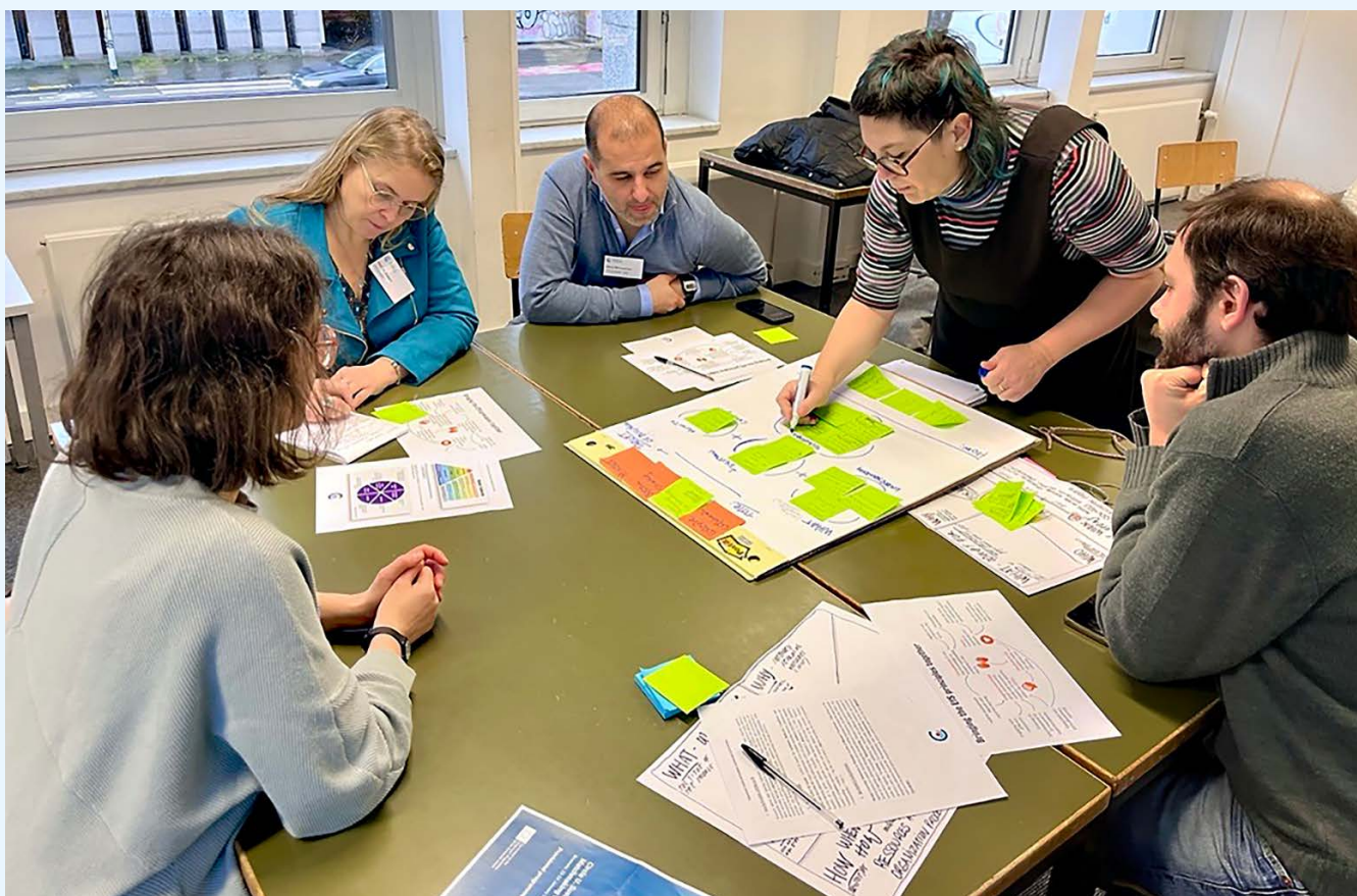
Academics brainstorming on new bachelor modules in Brussels, January 2025

Dean of the Open Campus, Universitetet i Oslo