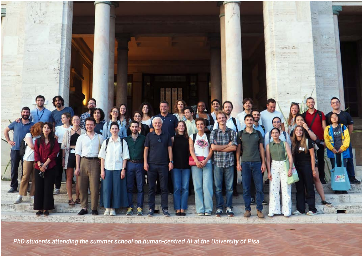
PhD students attending the summer school on human-centred AI at the University of Pisa.

"It was an enriching experience that broadened my perspective on human-centred and trustworthy AI, thanks to the contributions of experts from diverse universities and backgrounds. Since AI is increasingly pervasive in daily life, exploring it from different angles is essential to improving our overall understanding. The event also helped me realise how