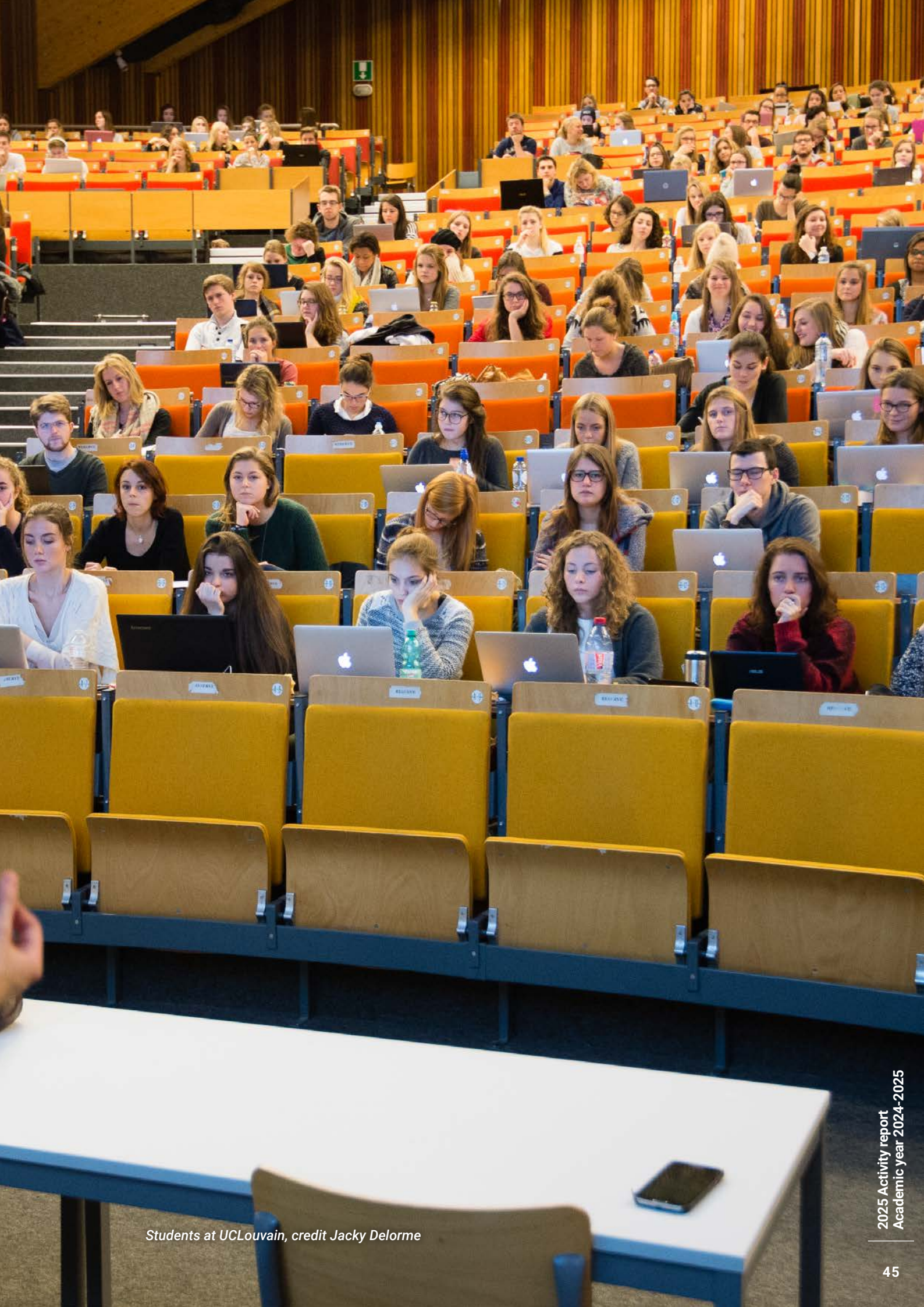
Students at UCLouvain, credit Jacky Delorme