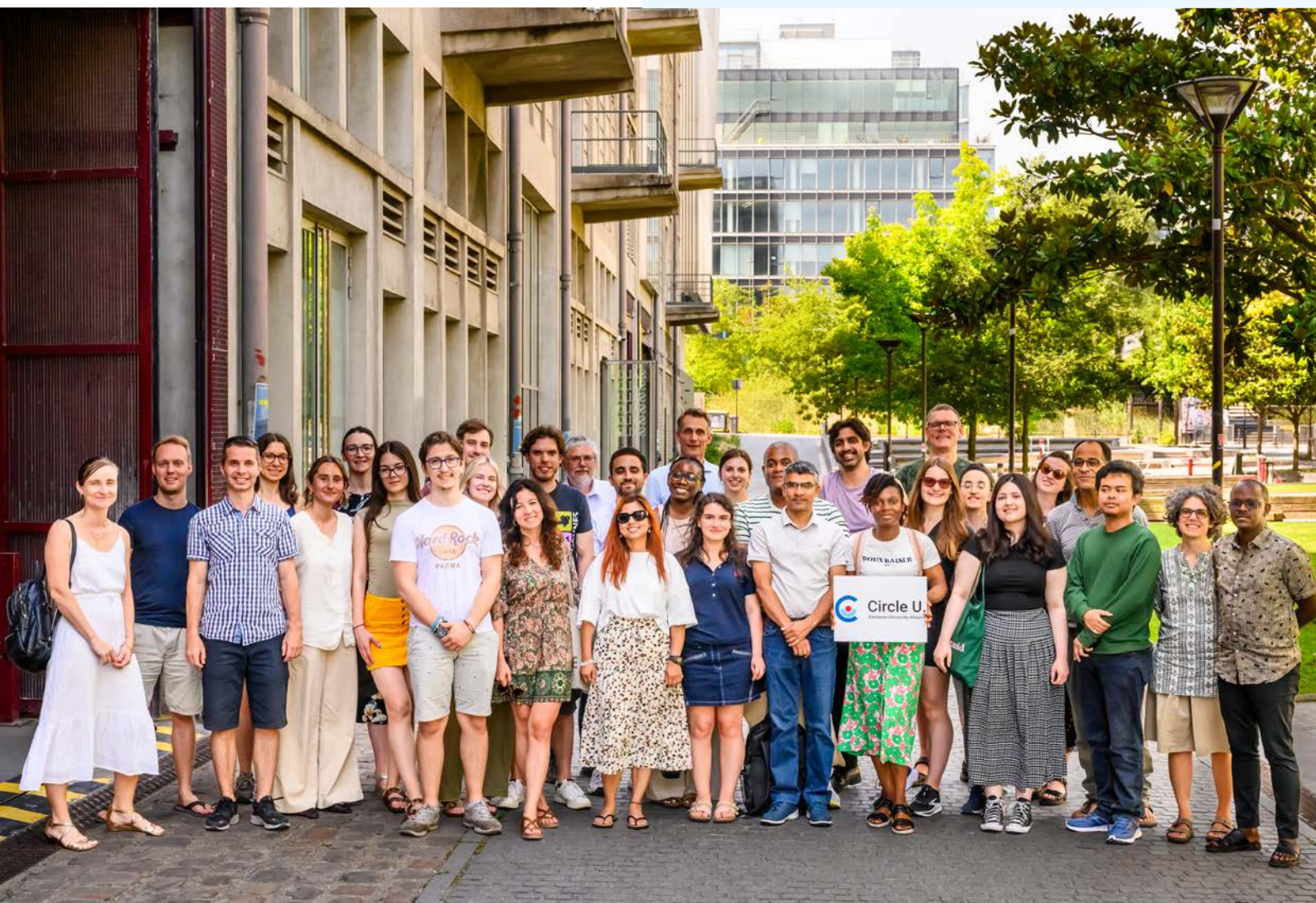
Students attending the global health summer school at Université Paris Cité.