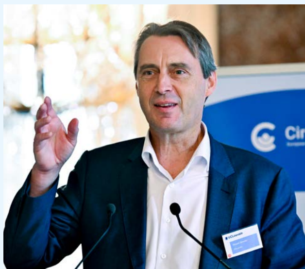
Vincent Blondel, Former Rector of UCLouvain

The choice of a name for the alliance was already on the agenda of the Vienna meeting in 2018. We discussed it at length and considered a long list of acronyms, constellation names, geometrical figures, and famous university figures. Despite lengthy discussions, we couldn’t reach a consensus. It was only a few months later that “Circle U.” was chosen. Some people had noticed that the distribution of the universities on the map resembled a circle. Not exactly, perhaps, but the idea resonated. “Circle U.” sounded right. Everyone agreed. The name was born.”