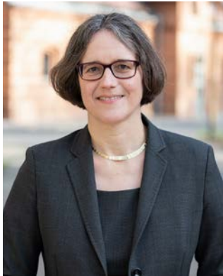
Circle U. President