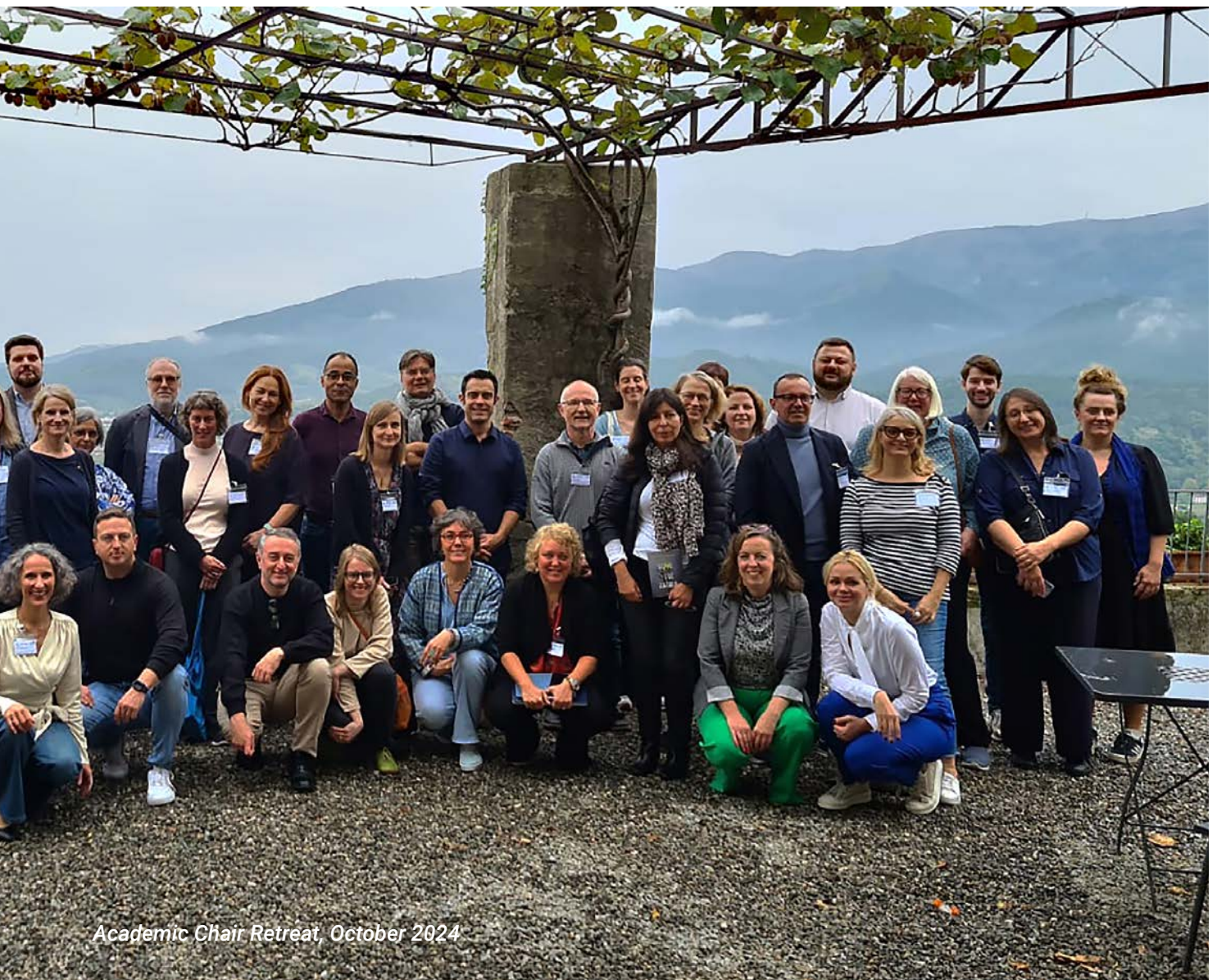
Academic Chair Retreat, October 2024