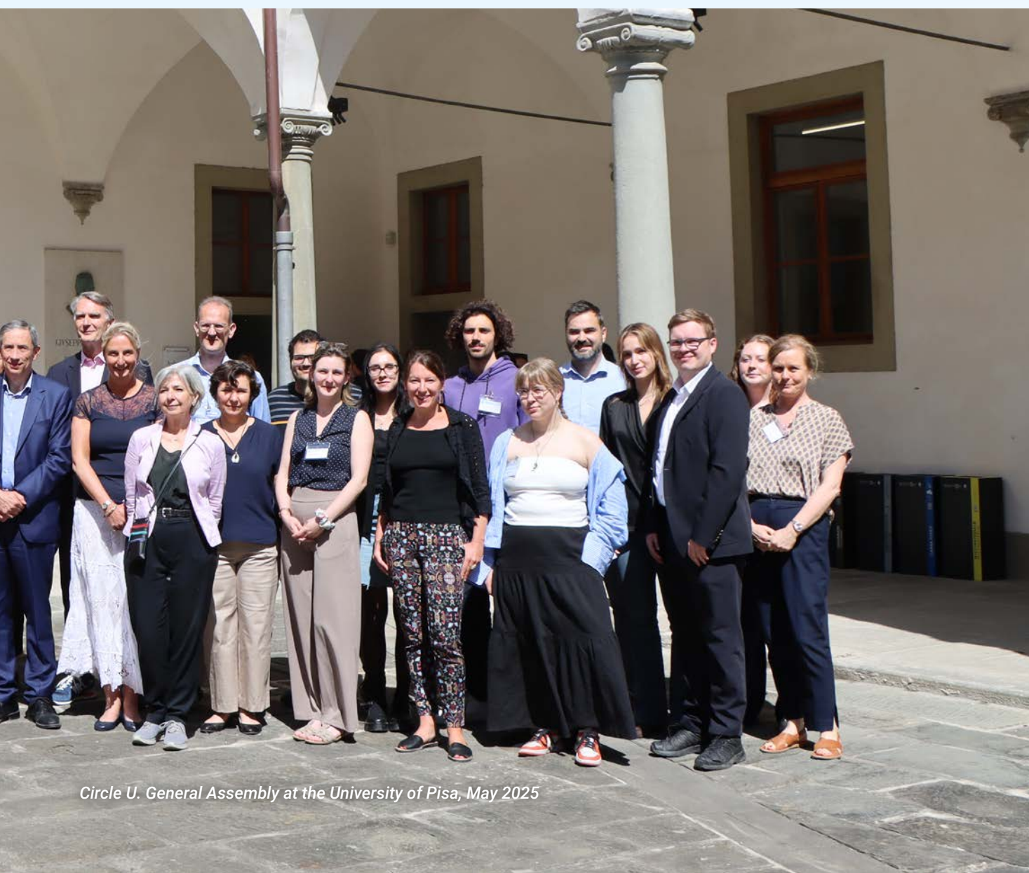
Circle U. General Assembly at the University of Pisa, May 2025