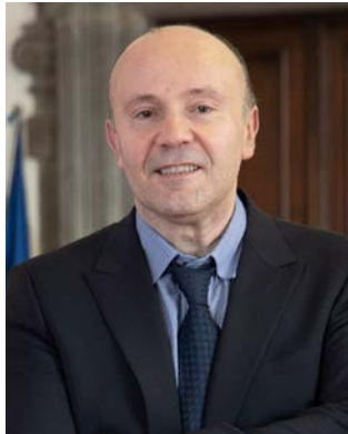
Chair of the Management Board