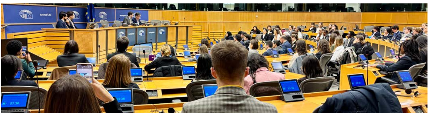
The CU.MUN brought students to the European Parliament, December 2024

The Circle U. MUN, "Model United Nations" is the simulation of a conference at the United Nations. This year's edition, held in December 2024, dealt with the societal, ethical and regulatory challenges of AI. The programme was composed of a longitudinal component over the semester with webinars that provided students with methodological tools and topic-based knowledge and prepared them for the residential week during which they simulated a United Nations session along with debatable issues concerning the main topic.